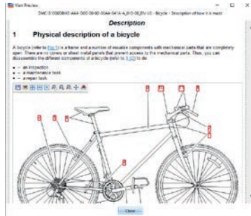
Quick DM preview

notusCSDB is built for users. Activity is intuitive, your working environment is customisable, and you can save and recall multiple workspaces. Your main author view only shows work assigned to you although you can access the entire project view when required for reference.